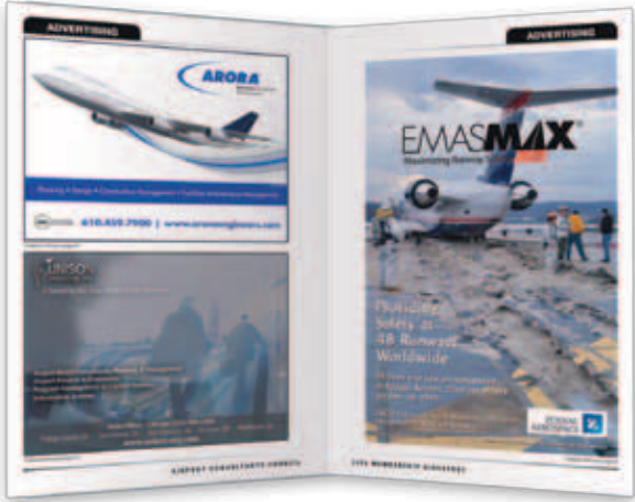
Sample ad pages from 2010 ACC Membership Directory

For more than 25 YEARS the ACC Membership Directory has been the PREMIER RESOURCE of private sector firms for airport and agency personnel.